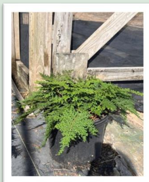
FERN 'ARBORVITAE' 3 GALLON