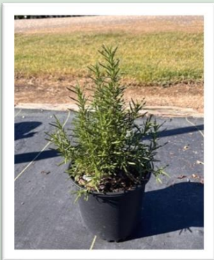
ROSEMARY 'TUSCAN BLUE' 1 GALLON

* MINIMUM ORDER REQUIREMENTS FOR SHIPPING: $2,500.00. Orders between $1,500 and $2,500 will incur a 10% fee for shipping.*