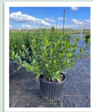
GARDENIA 'AUGUST BEAUTY' 3 GALLON