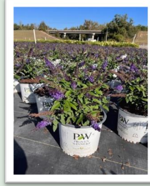
BUDDLEIA PUGSTER BLUE® -PW 3 GALLON